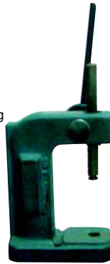
Order No. POA