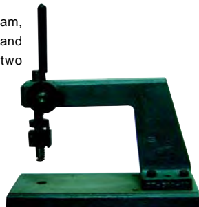
Order No. POA